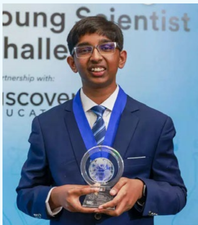
3M Young Scientist Lab