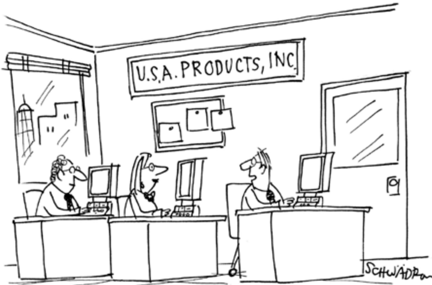
"Our salaries are so low, companies in India are outsourcing to us."